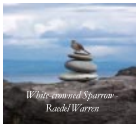
White-crowned Sparrow - Raedel Warren

In a four-hour session designed for both beginning and advanced photographers, award-winning wildlife photographers Stephen Cunliffe and Hal Everett will teach ways improve your nature photography. Learn how to use camera functions and lens options to improve composition and exposure and consistently take quality images. Stephen and Hal will analyze up to four images (in print or electronic form) for each participant. The workshop includes both classroom and field time. Registration is limited to 10, so register early.