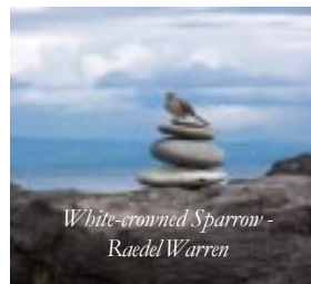
White-crowned Sparrow - Raedel Warren

In a four-hour session designed for both beginning and advanced photographers, award-winning wildlife photographers Ken and Mary Campbell will teach ways to improve your nature photography. Learn how to use camera functions and lens options to improve composition and exposure and consistently take quality images. Ken and Mary will analyze up to four images (in print or electronic form) for each participant. The workshop includes both classroom and field time. A portion of the proceeds of the workshop will be donated to the Northwest Raptor Center. Registration is limited to 10.